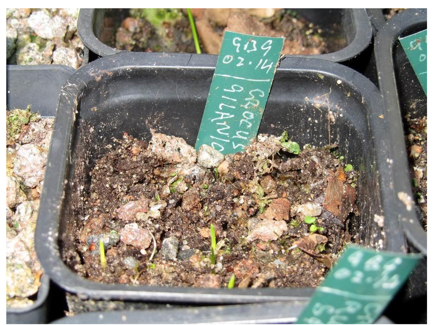
Here is a pot of Crocus seed, also sown last February, which has sat outside all year and is now germinating.