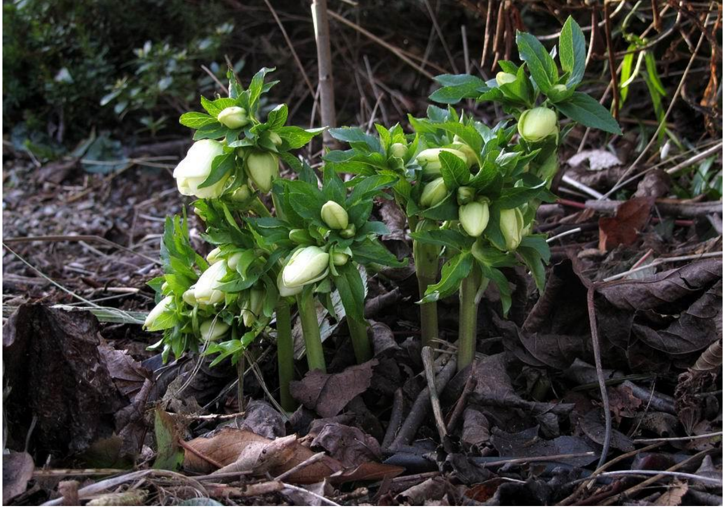
With the old leaves removed we can fully appreciate the mass of new flower shoots.

It is interesting to speculate what happens in the wild where there is no gardener to cut back the old leaves. My first thoughts are that maybe the climate and environmental conditions in the wild do not allow the leaves to survive through the winter. Even if they do survive the old leaves may flop outwards opening up the centre of the plant where the new growth emerges as on this pale yellow flowered hellebore.