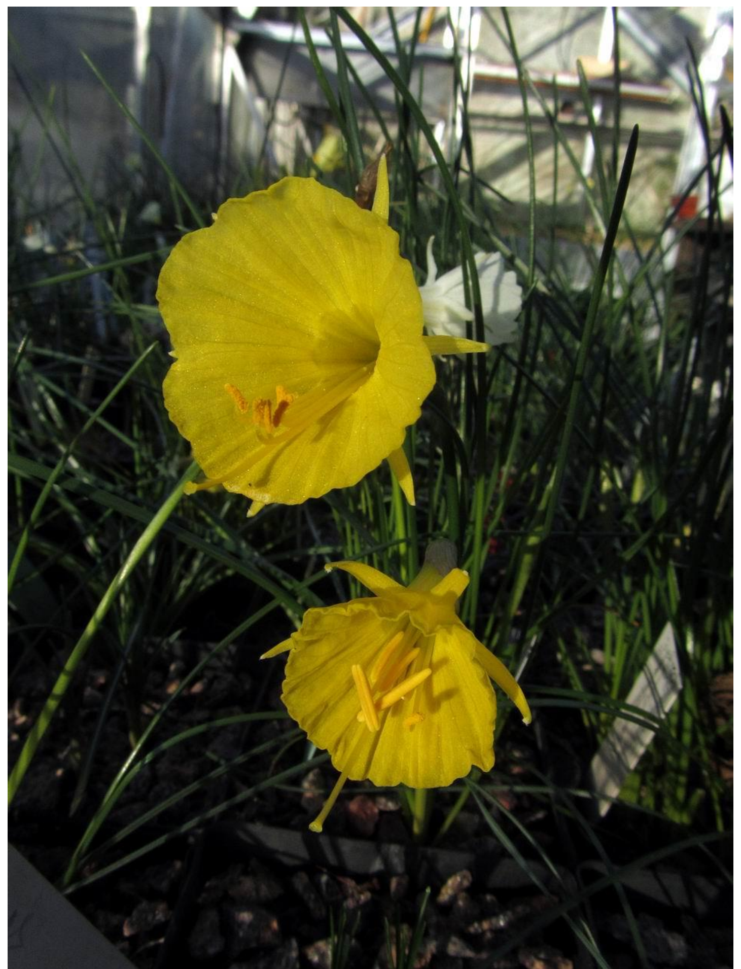
Narcissus bulbocodium seedling

I raised this seedling from seed set on a Narcissus bulbocodium form originally collected in Morocco - it was open pollinated so I am not sure that it has not hybridised. It is one of my favourites with good shape and a dark crystal yellow colour - note also the hair like tips to the petals that we see on many bulbs.