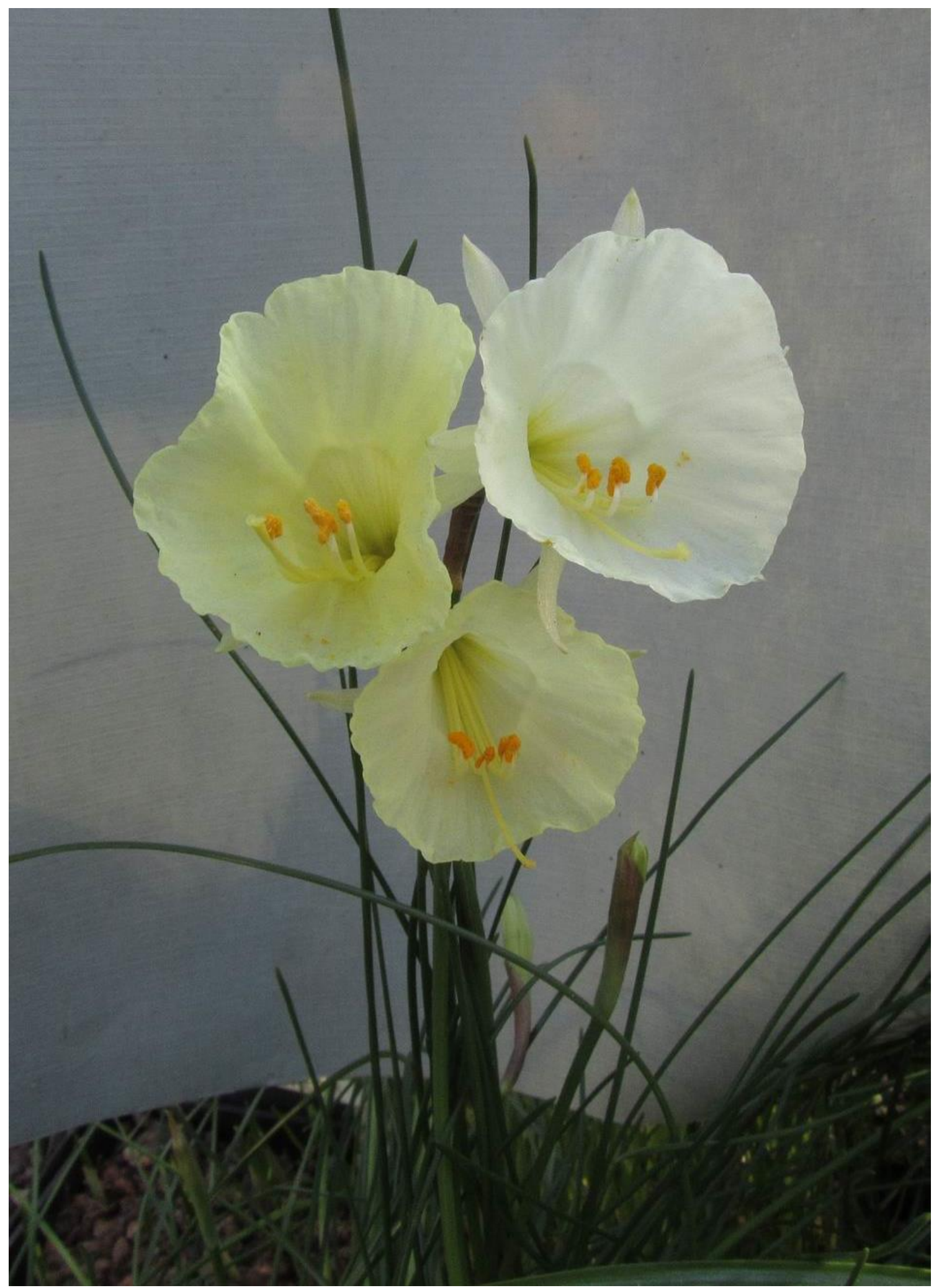
There is a saying 'like peas in a pod' meaning how similar they are – the seeds may look alike but the flowers raised will differ in both looks and tolerance as demonstrated by these three seedlings from a single pod......