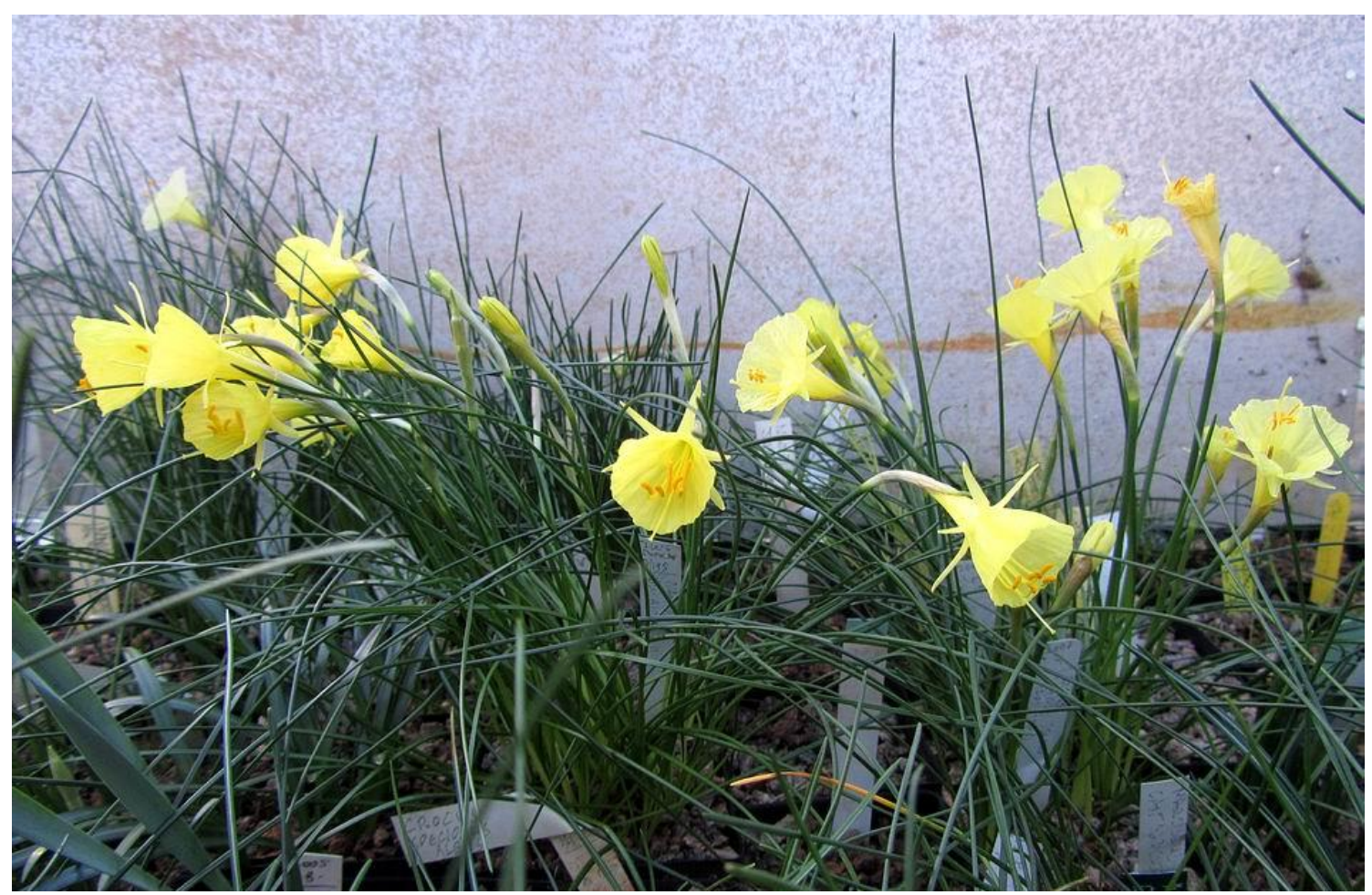
In the bulb house Narcissus bulbocodium forms and hybrids continue to delight.