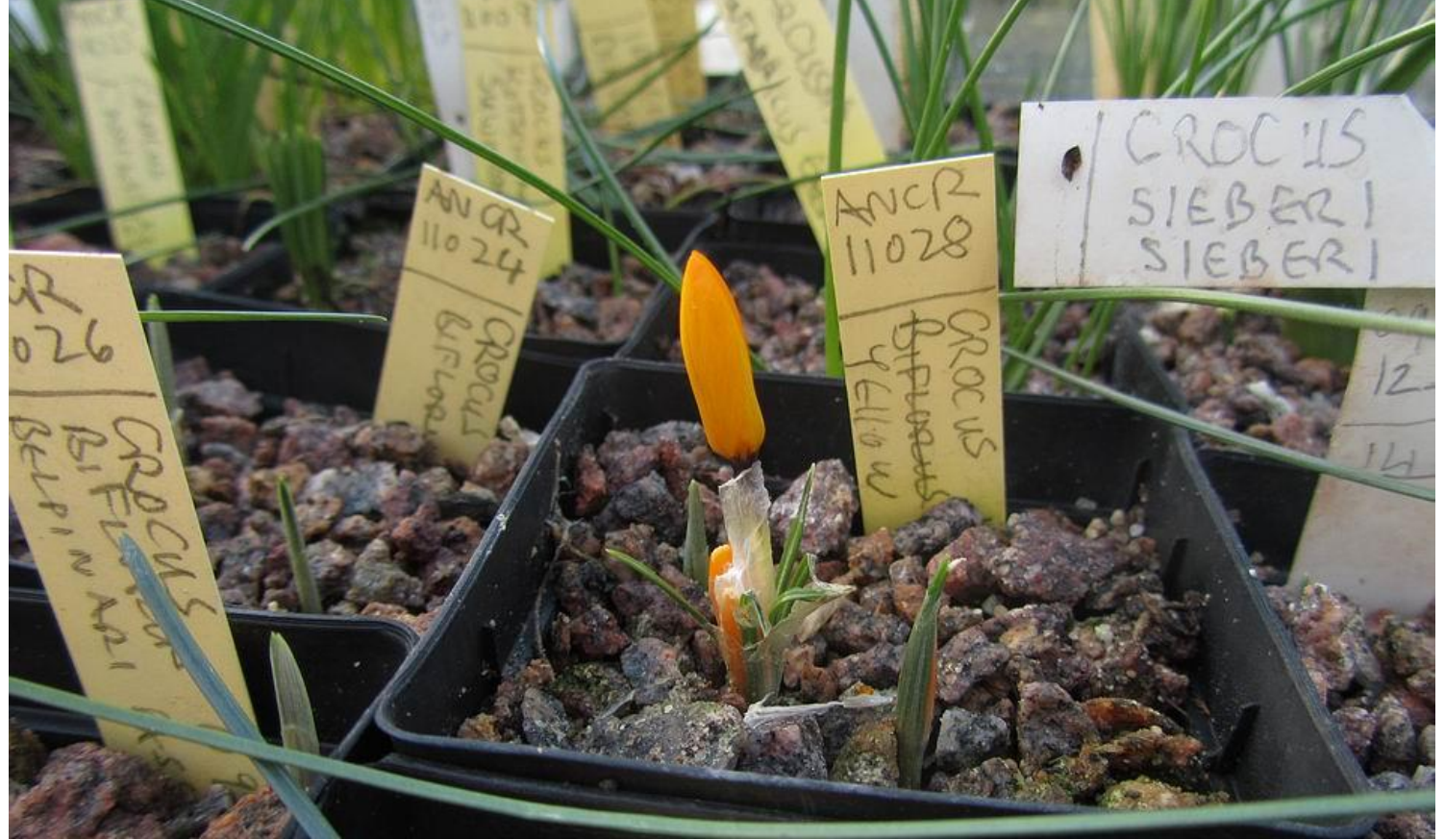
A yellow Crocus, most likely Crocus chrysanthus, shows that it is not always possible to know what you are collecting from seed – as this was thought to be C. biflorus seed. It is a lovely form with a nice dark purple tube.