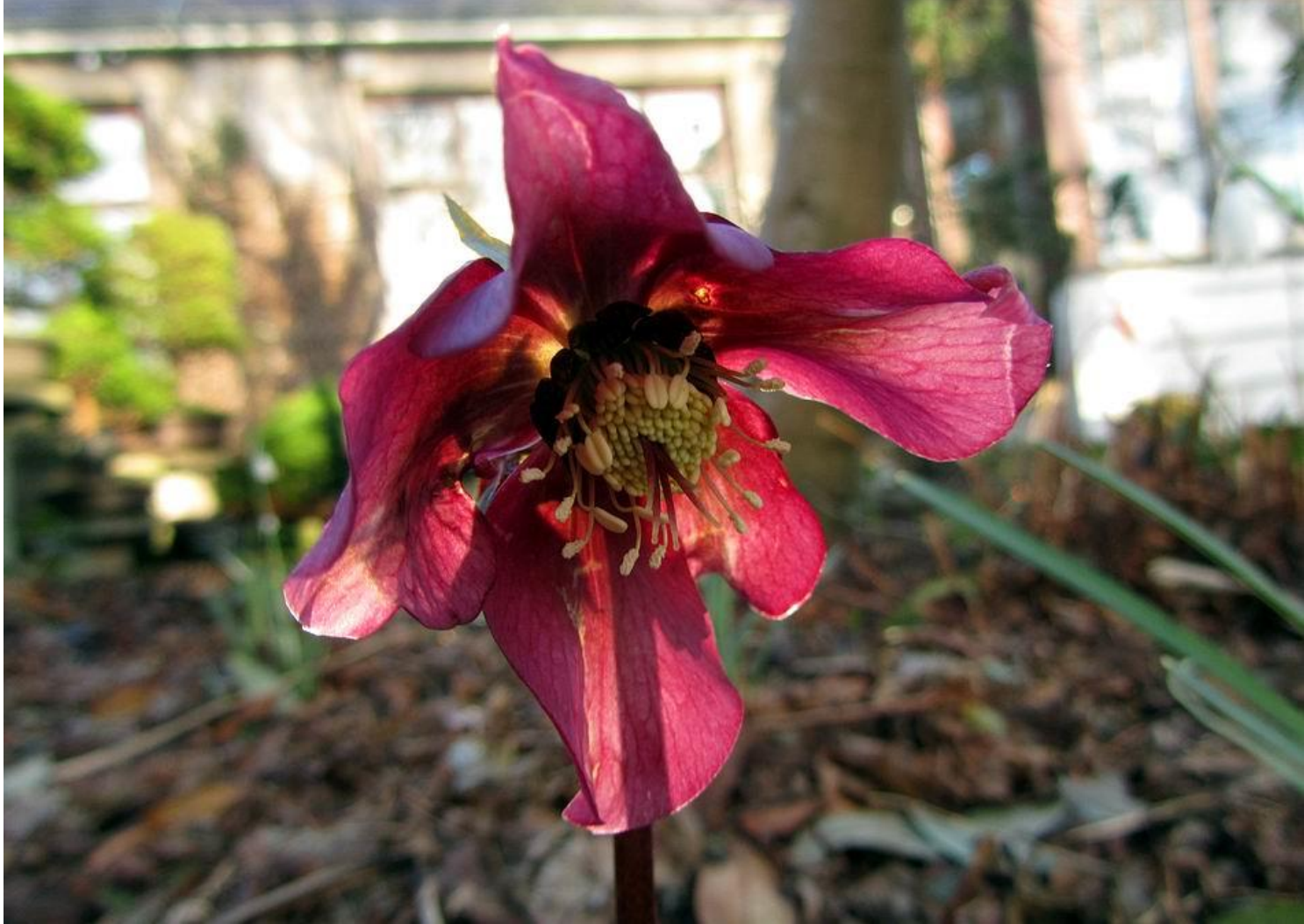
A single red flowered Helleborus seedling enjoys the cold winter sunshine.