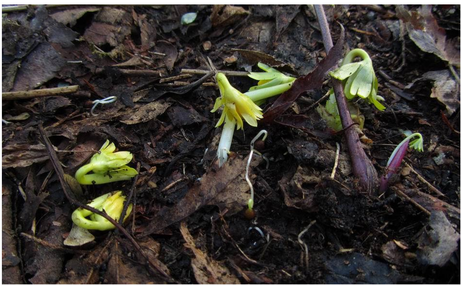
As I lifted the fallen leaves I reveal these Eranthis hyemalis shoots along with germinating seeds – I am always amazed at how they are able to grow in such cold winter conditions and wonder what exactly triggers their growth.